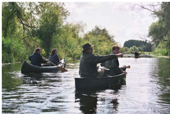
During the excursion 2007 at the Naturpark Am Stettiner Haff with two Park Ranger