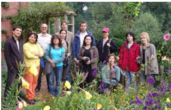
The recent group of trainees at their arrival at the Alfred Toepfer Academy for Nature Conservation (19.08.2008) together with the project team.