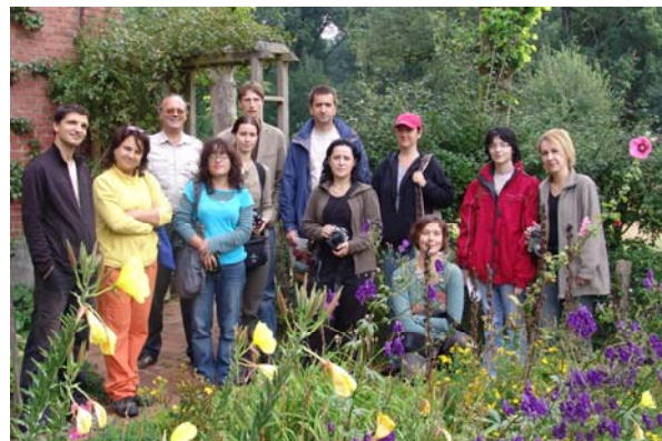
The recent group of trainees at their arrival at the Alfred Toepfer Academy for Nature Conservation (19.08.2008) together with the project team.

The ten trainee positions per year are open to younger (up to 40 years) employees and decision-makers in the field of nature conservation and regional development from NGO's and GO's.